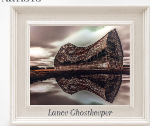
FEATURED METIS ARTIST